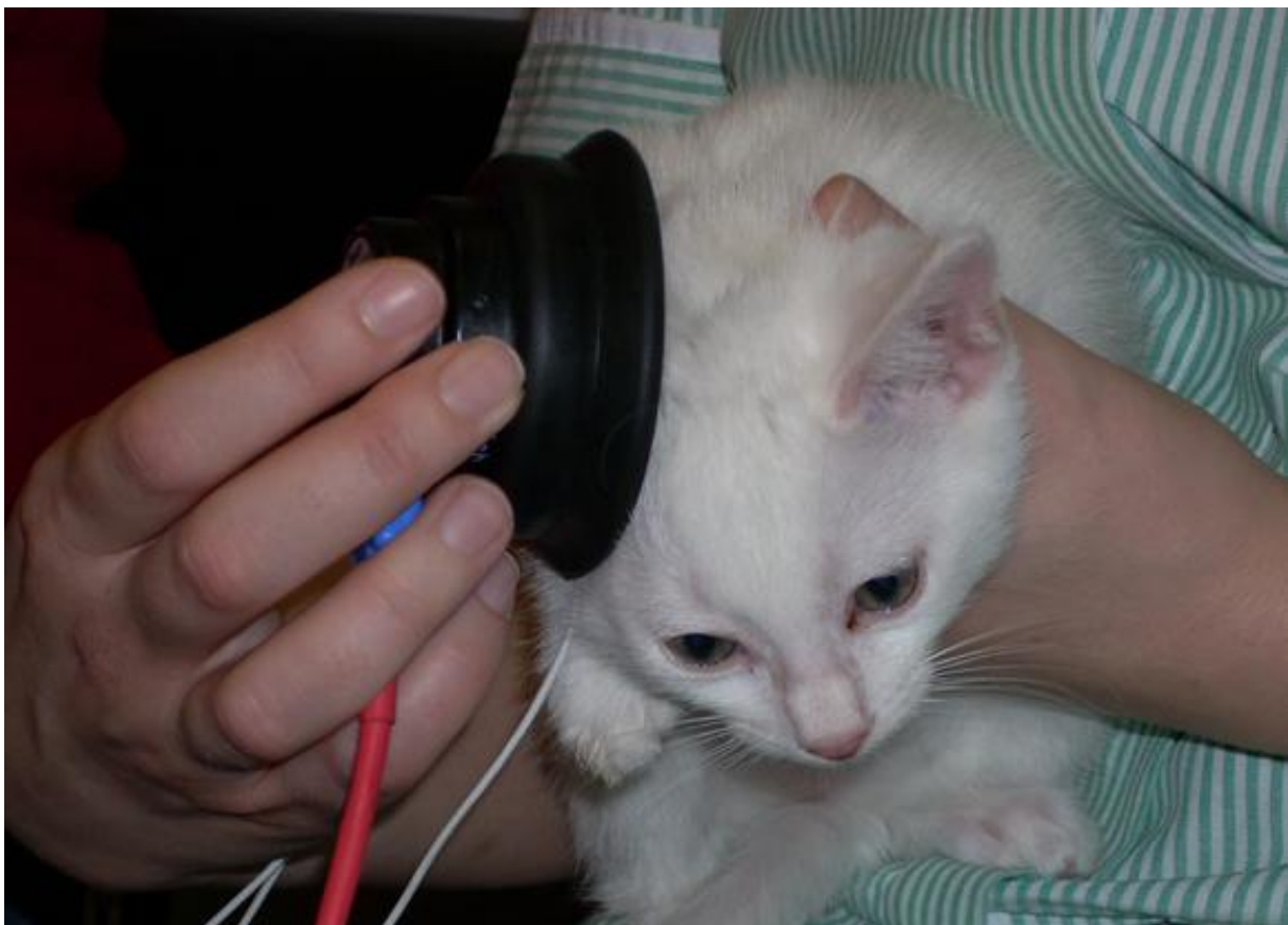
Figure 2 shows the test being carried out on an 8 week old Russian White kitten.

However, in an anxious or uncooperative cat, a light sedative may be used, which has worn off by the time the cat is ready to leave. Testing can be carried out on kittens as young as 8 weeks. Tests can also be carried out on adult cats (a pre-mating hearing assessment, for example).