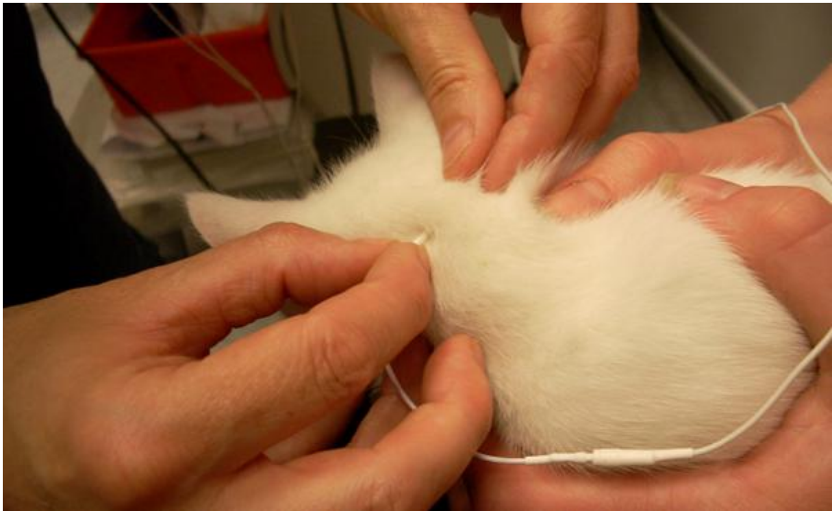
Figure 1: Russian White kitten accepting the insertion of the fine needles

However, in an anxious or uncooperative cat, a light sedative may be used, which has worn off by the time the cat is ready to leave. Testing can be carried out on kittens as young as 8 weeks. Tests can also be carried out on adult cats (a pre-mating hearing assessment, for example).